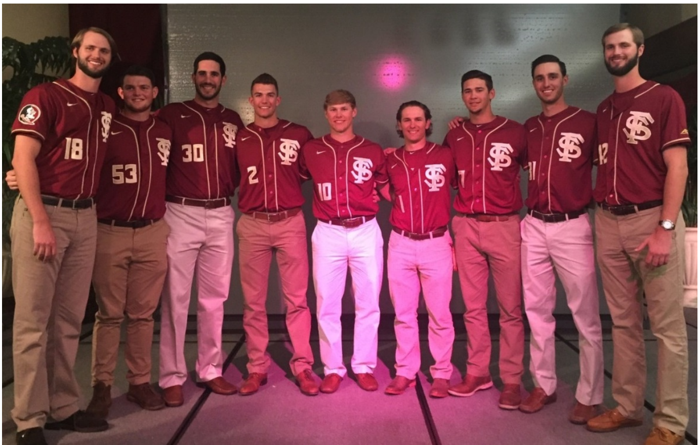
Nine Pikes Lead the 2016 Seminole Baseball Team