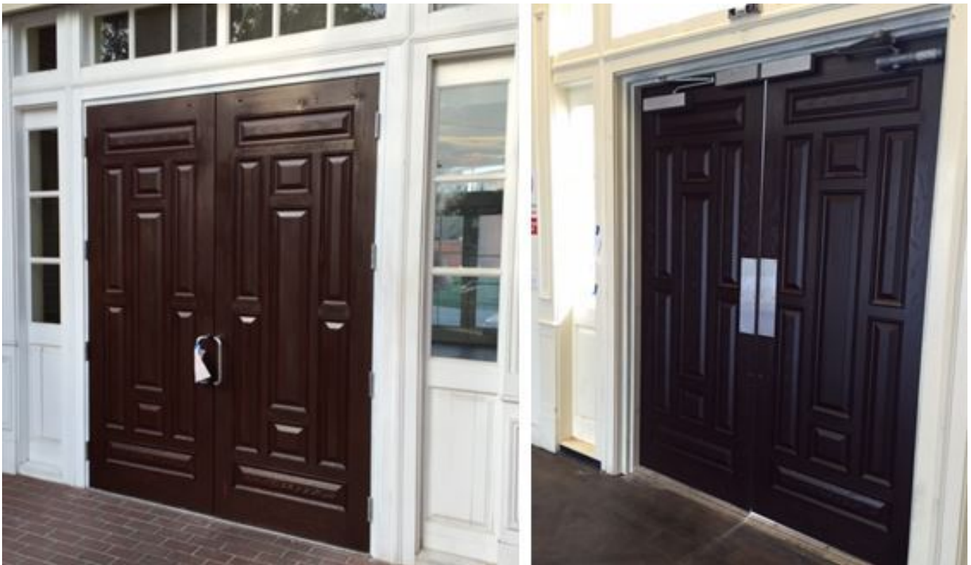
Beautiful New Pike House Front Doors